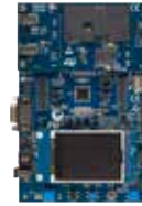
STM32G081B-EVAL STM32G0C1E-EV Evaluation boards

A full set of evaluation boards enables flexible prototyping as well as full STM32GO evaluation.