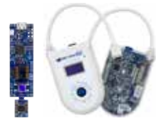
STM32G0316-DISCO / STM32G071B-DISCO (USB Type-C™) Discoverv Kits